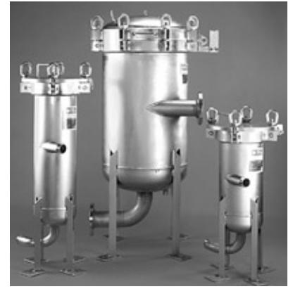
Models HUR 170 ASME, HUR 850 ASME and HUR 90 ASME